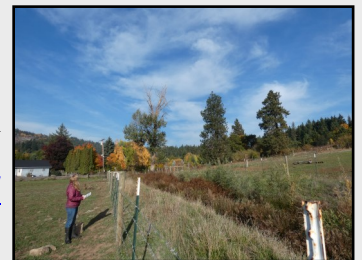
(photos show before (left) and after (right) implementing a riparian fencing and planting project on a small stream)